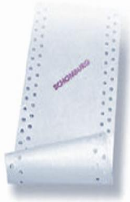
MYK Aso Joint Tape 2000

Packing: 12cm x 50mtrs Roll 20cm x 50mtr Roll